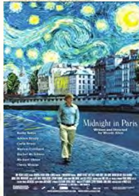
Midnight in Paris (2011)