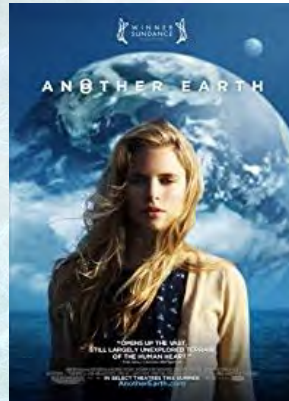
Another Earth (2011)