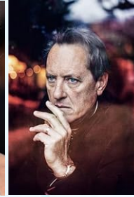
Richard E. Grant