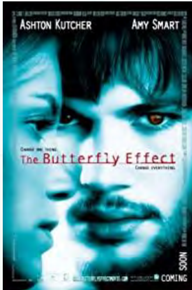
The Butterfly Effect (2004)