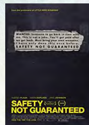
Safety Not Guaranteed